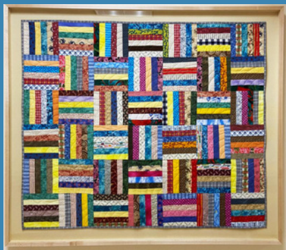
ABOVE: CCRMC Volunteer Susan Tunison, Untitled (Quilt). Up-cycled face mask fabric

Beyond a mere art installation, Resilience stands as an expression of gratitude to healthcare workers for their bravery and contributions to the overall wellbeing of the community during challenging times. Shown are just a few pieces from the spectacular collection.