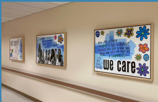
Milton Bowens, We Care . Acrylic paint and collage on panel